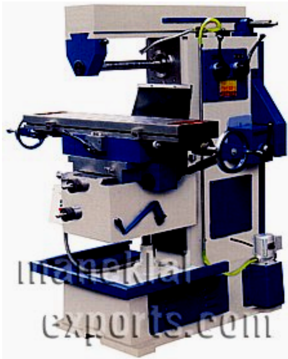
Universal Milling Machine Model: BM 1.5 GH

Geared Head Universal Milling Machines with chain drive